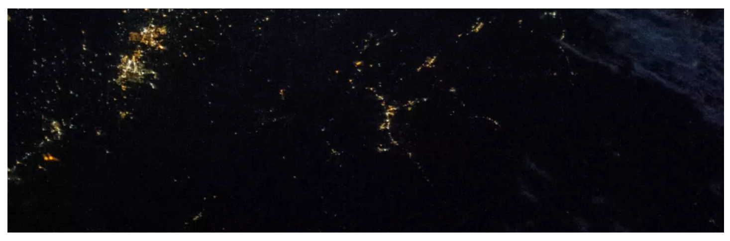
An image from space shows the nighttime lights of Northern California in September 2013.

Above San Francisco in this image is the Pacific Ocean. To the right is Marin County, with little light showing in sparsely populated West Marin in the top right.